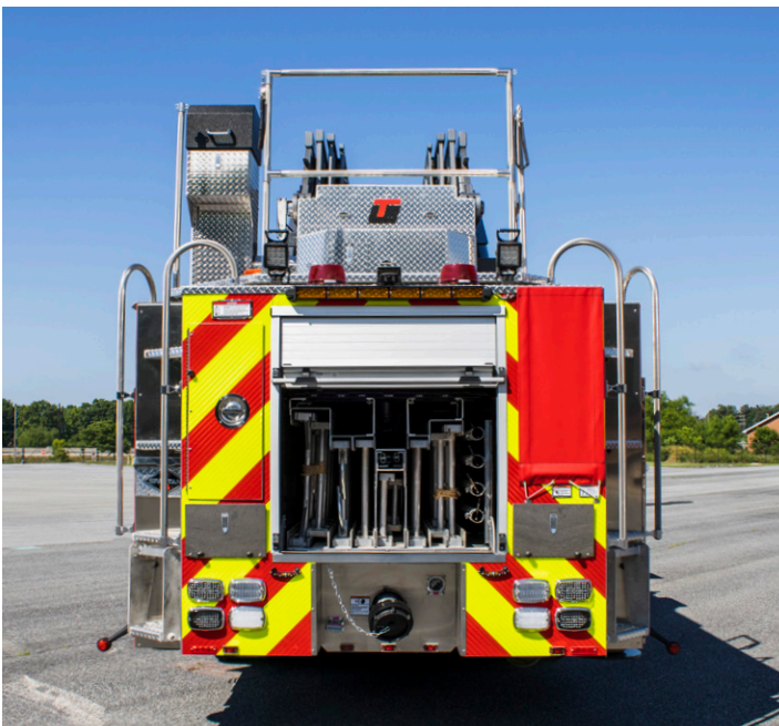
LOW GROUND LADDER STORAGE: Fully enclosed ground ladders are located just 40" from the ground, providing safe and ergonomic access to up to 170 ft. of storage.