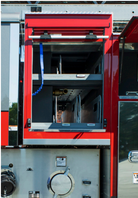
LOW CROSSLAYS: The low profile pump creates a safe and more ergonomic access to crosslays.