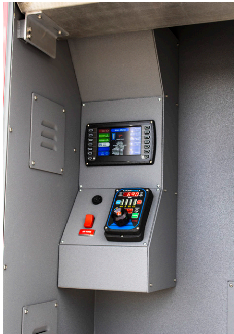
PUMP OPERATORS PANEL: The pump operators panel can be found inside the L2 compartment. Choose from standard controls or the optional Omni Pump System shown above.