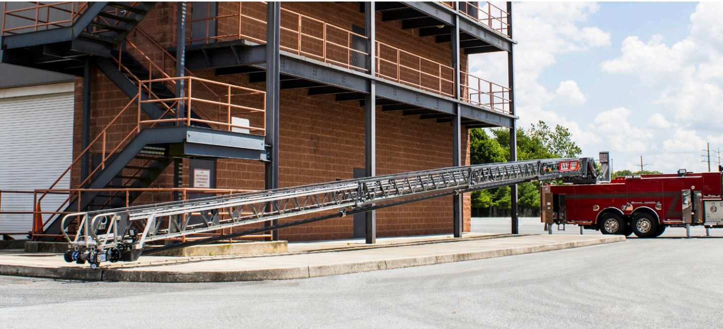
EXCELLENT HORIZONTAL & VERTICAL REACH: Built with up to 100,000 psi yield strength steel that can be depressed as low as 7° below horizontal or as high as 78° above horizontal. This allows firefighters to reach taller structures and have easy access to the ladder when lowered to ground level.