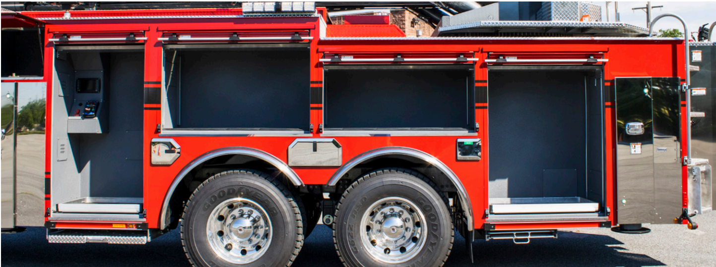
MAXIMUM STORAGE SPACE : The unique packaging of the NXT110 offers maximum storage space inside the cab and body compartments.