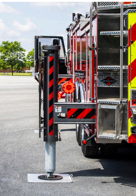
NARROW OUTRIGGER SPREAD: It's simple, if you can open your door you can set the jacks. A 12' outrigger spread with quick and simple deployment delivers industry leading performance.