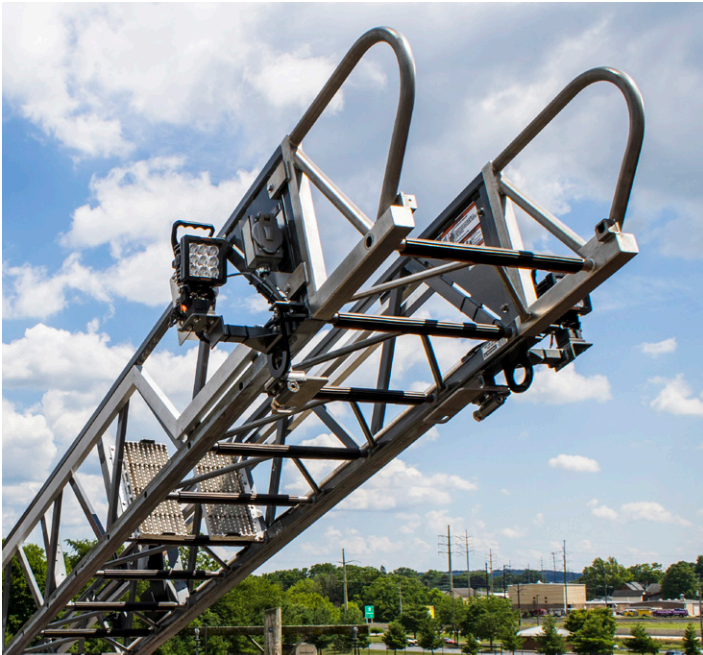
REPLACEABLE EGRESS: Designed with an unobstructed opening for easy access, the bolt-on removable egress can be easily replaced. Available in various lengths.