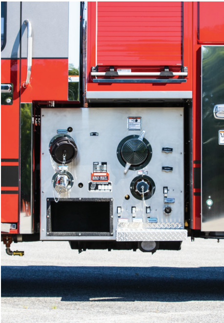
MAXIMUM PUMP CAPABILITIES: The non-proprietary NXT pump offers up to 2,250 GPM along with added room and storage in the cab and body.

A more compact, yet powerful NXT pump with up to 2,250 GPM and a 500 gallon tank provide the power needed to manage any situation. The pump is positioned at the rear of the cab under the seat extension allowing for a full body pump, without taking up space inside the cab. Low pump inlet and discharges provide a safe and ergonomic work environment.