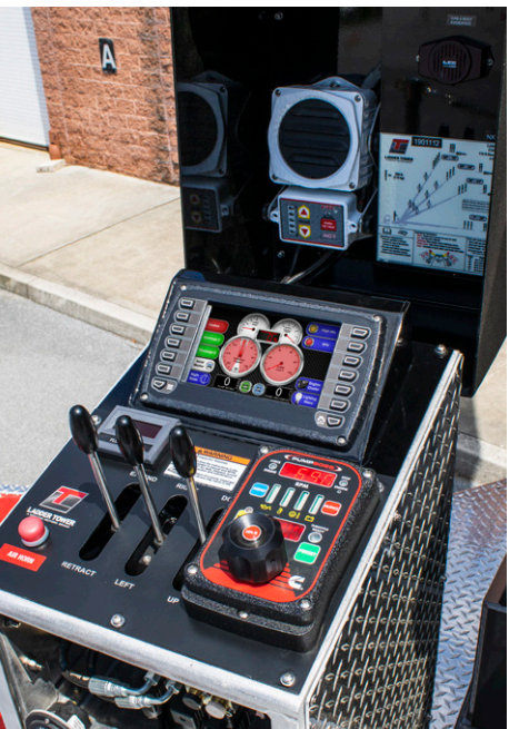
AL-11 AERIAL LOGIC: A totally integrated system that provides instant feedback on a ladder's extension, location, retraction, angle, load and breathing air system status, as well as J1939 engine information.