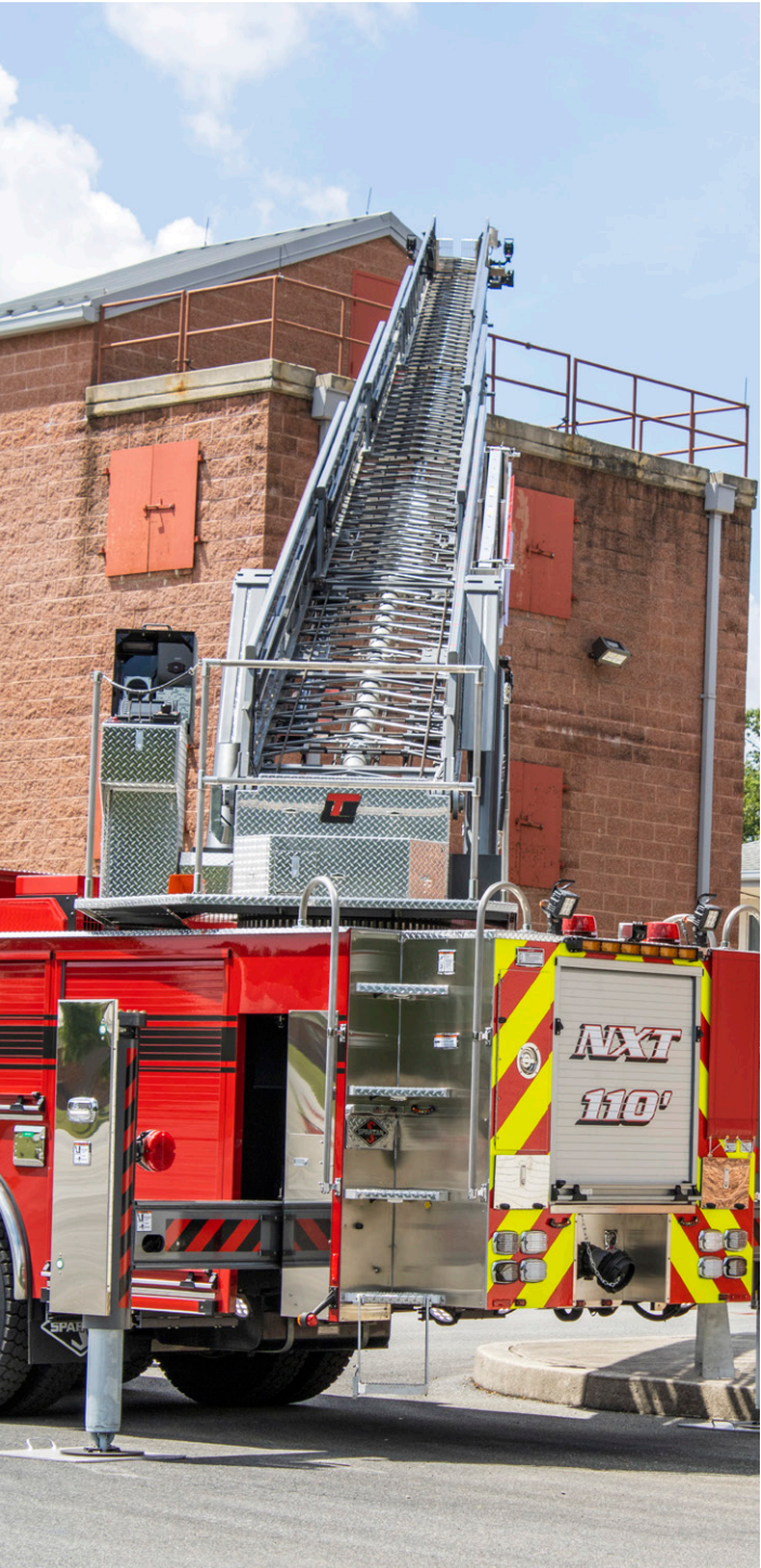
SAFE & EASY ACCESS: Wide egress steps and walkways provide easy access to and from the ladder.