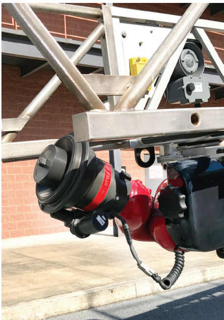
WATER MONITOR: When positioned at the tip, the water monitor can be elevated 30° higher than the elevation of the ladder.